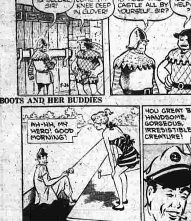
BY PETER HOFFMAN