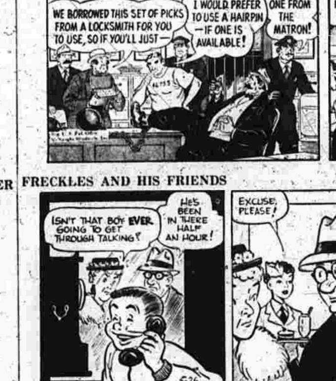
BY WILSON SCRIGGS